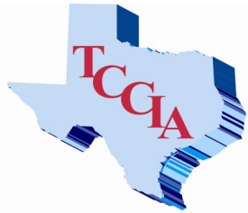
Texas Community College Instructional Administrators